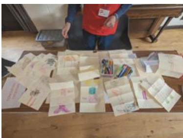
Messy Church Pictures