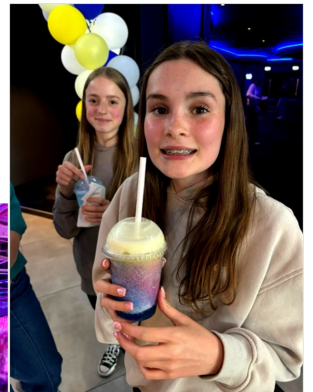
Photos from Summer Youth Trips